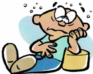
WEAKNESS OR FATIGUE